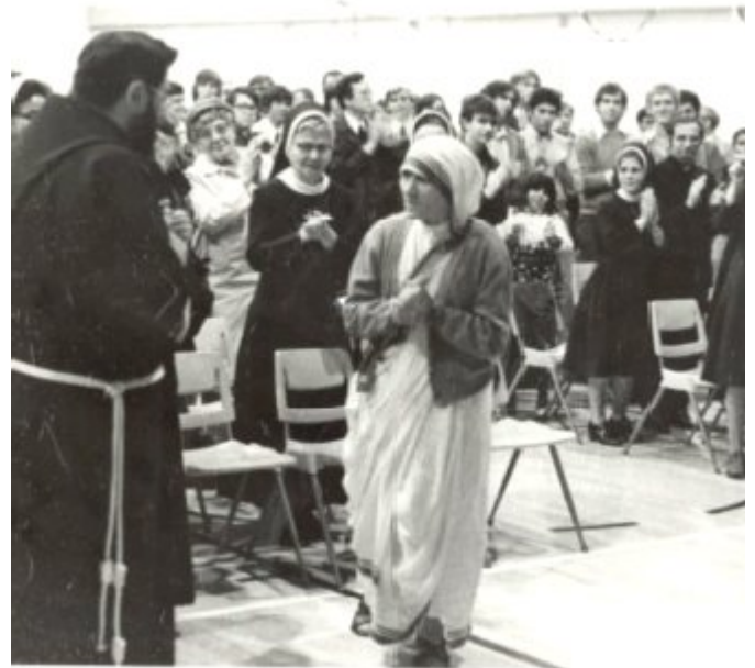
"Father, you are such a liar!"

As the sisters exited the dining room I led them to the gym. When Mother Teresa entered and saw the crowd she turned to me and said, "Father, you are such a liar!" I thought for sure I had been sentenced to hell. Then Mother smiled. A sigh of relief could be heard as I exhaled.