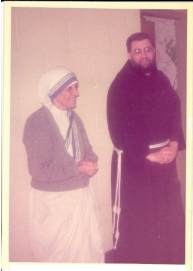
"One Soul Out of Purgatory"

I tried to intervene but her firm voice told me to leave them alone. She said she made a deal with God. "One soul out of purgatory for every photo taken of me or for each time I sign my name." We waited and waited and waited. It was now almost 10:30 p.m. I suggested that we end with Benediction of the Most Blessed Sacrament. Her eyes beamed. "You are the first priest to suggest that – yes! absolutely."